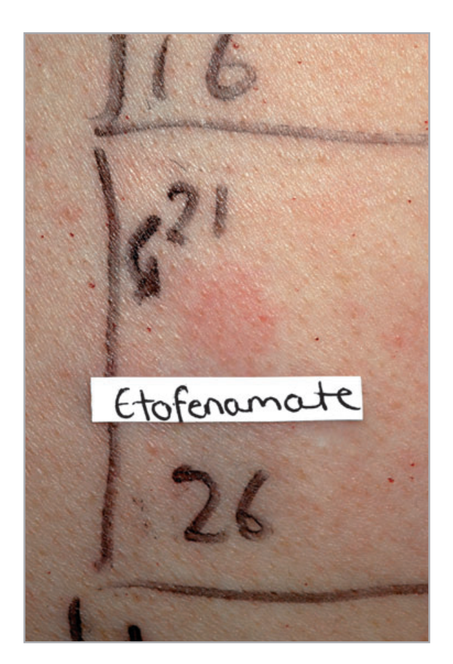
Fig 2. Close-up of etofenamate reaction at 24 h post irradiation in irradiated set, displaying '+' International Contact Dermatitis Research Group grade reaction.

The UV absorbers most commonly leading to PACD were octocrylene and benzophenone-3. As discussed above, many subjects may have developed cross-reactions to ketoprofen. However, they appear to have an inherent photoallergenic po-